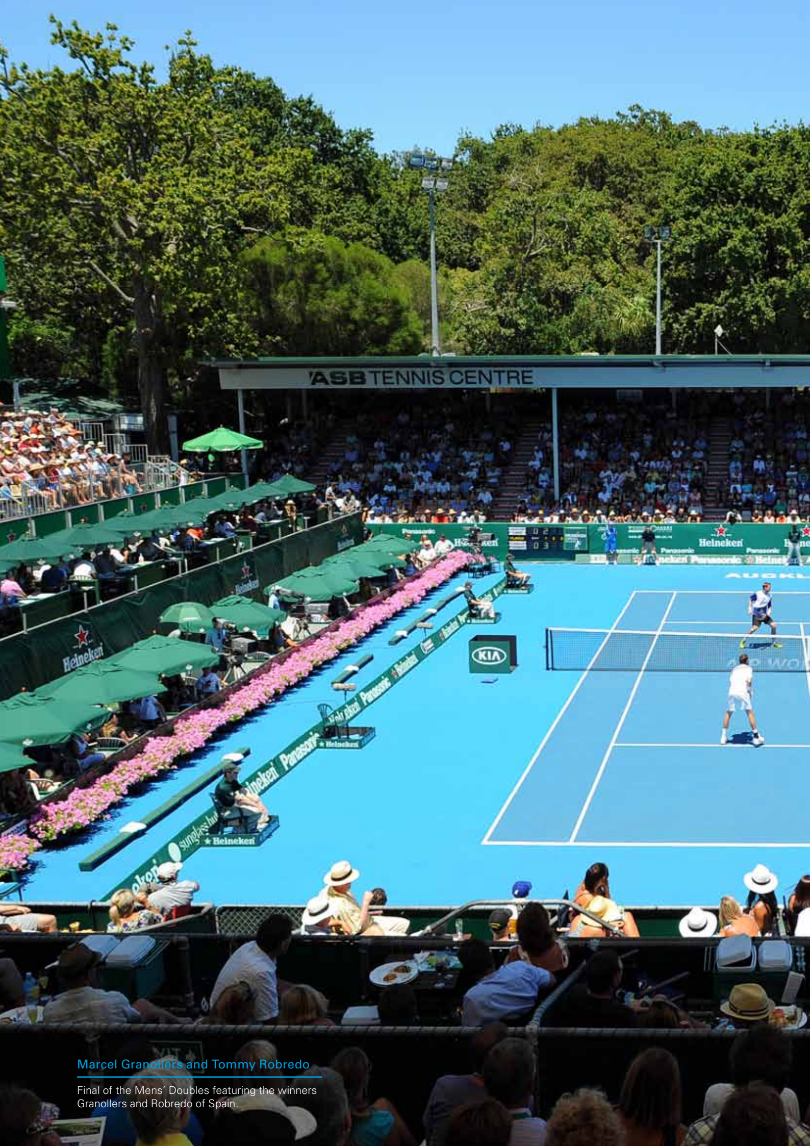
Marcel Granollers and Tommy Robredo

Final of the Mens' Doubles featuring the winners Granollers and Robredo of Spain.